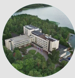
RUISSALO SPA HOTEL 3* TURKU, FINLAND 170 ROOMS