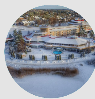
NAANTALI SPA HOTEL 4* NAANTALI, FINLAND 251 ROOMS