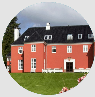
SINATUR HOTEL SKARRILDHUS 3* KIBEK, DENMARK 81 ROOMS