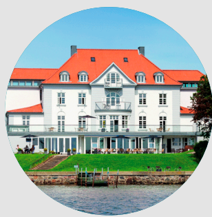
HOTEL SIXTUS 3* MIDDELFART, DENMARK 27 ROOMS