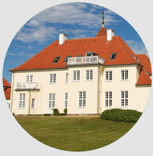
SINATUR HOTEL GLAVERNAES 4* EBBERUP, DENMARK 73 ROOMS