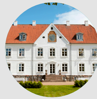
SINATUR HOTEL HARALDSKAER 4* VEJLE, DENMARK 50 ROOMS